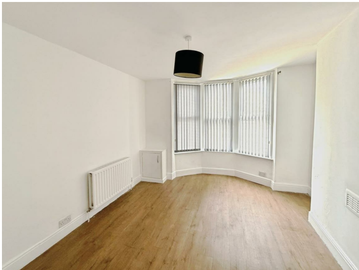
Double bedroom with side aspect of property, laminate flooring and neutral decor