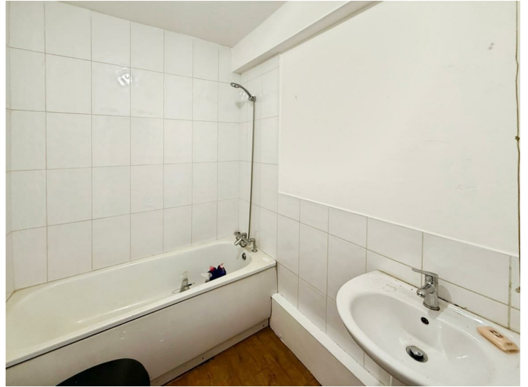
bathroom with shower over bath, basin with pedestal and w.c.