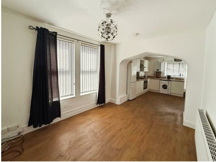
Feature bay window with laminate flooring and neutral decor, laminate flooring.