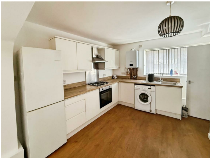
Fitted kitchen with oven hob and extractor with tiled splash